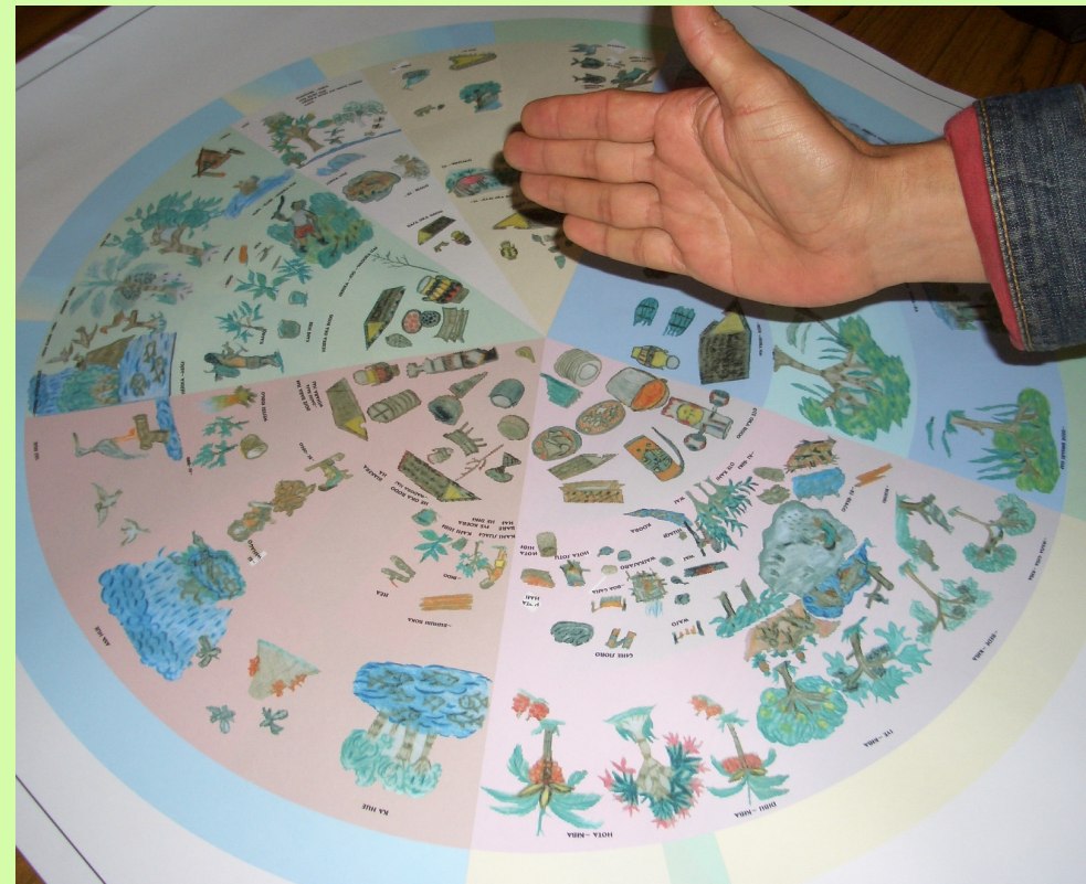
Pira Paraná, Colombia