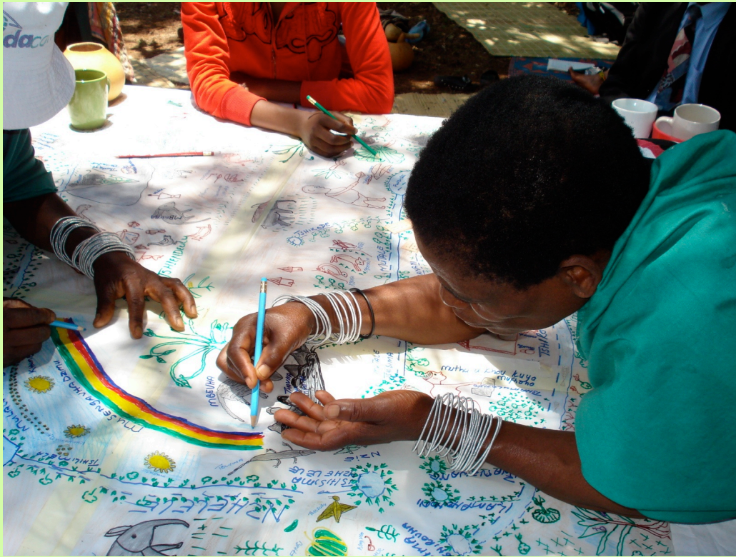
Venda, South Africa