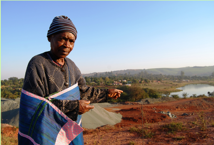
Venda, South Africa