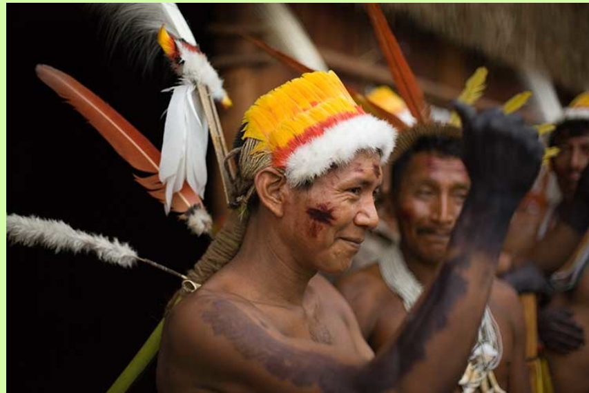
Pira Paraná, Colombia