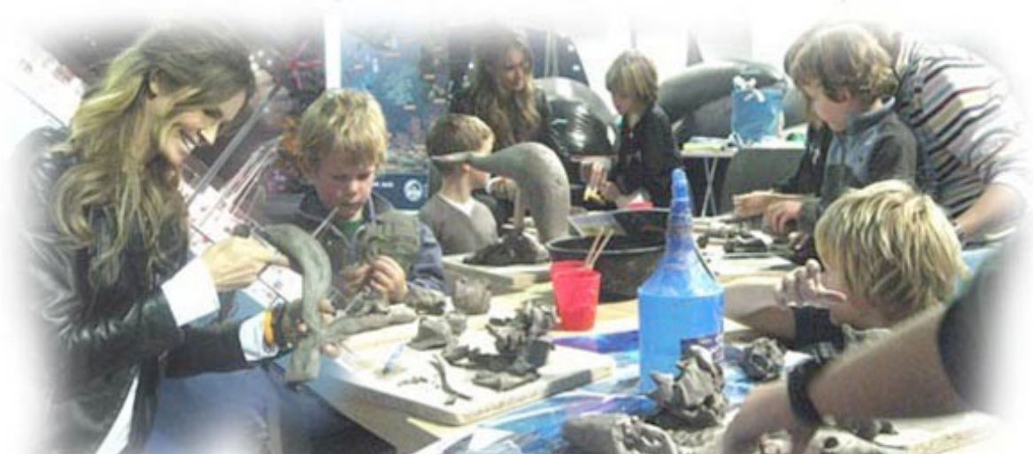
Photo: Elle Macpherson and children at Earl's Court Boat Show